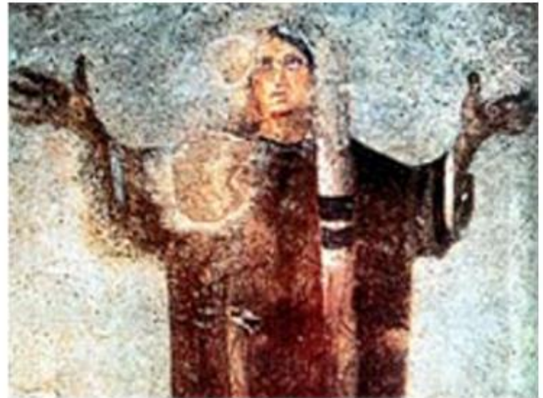
Ancient gesture of Christian Prayer from the catacombs of Priscilla